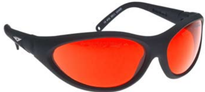
Laser Armor Aviator Glasses Frame Style: LA Razer