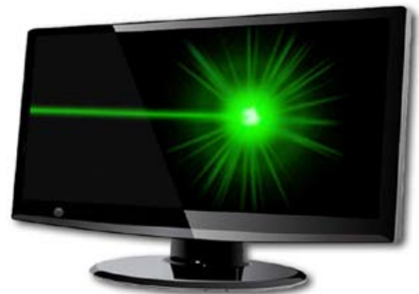
Laser Armor Aviation Laser Defense Training