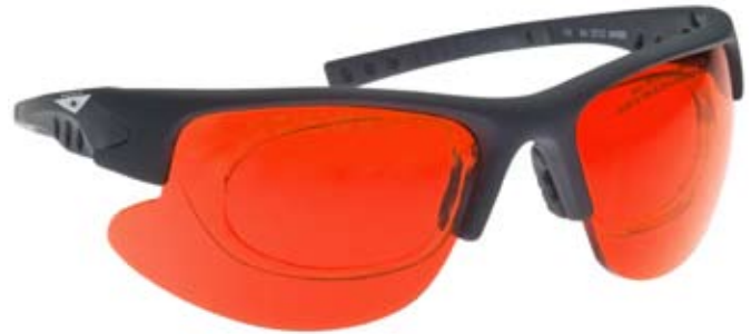
Laser Armor Aviator Glasses Frame Style: LA Blaze