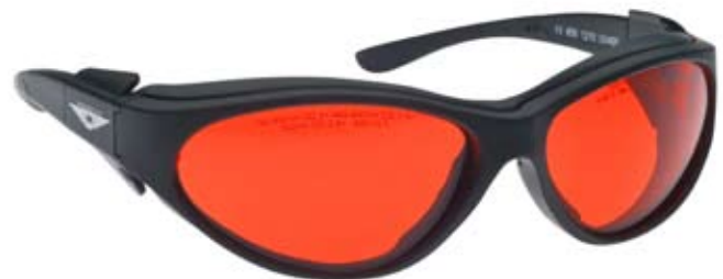
Laser Armor Aviator Glasses Frame Style: LA Bold